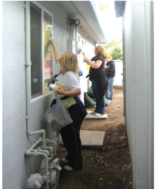
Thirty-one volunteers from Crosswinds Church spent a fall Saturday in Pleasanton giving our Pediatrics clinic a facelift -- washing windows, adding a fresh coat of paint to hallways, waiting room and office, and cleaning up the building's exterior.